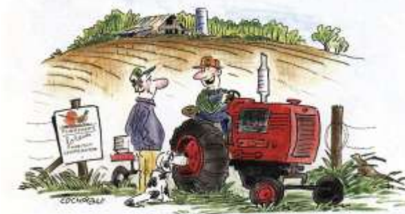
"PLANT IT AND THEY WILL COME."

Member Price = $102.00/ac. Non-Member = $106.00/ac.